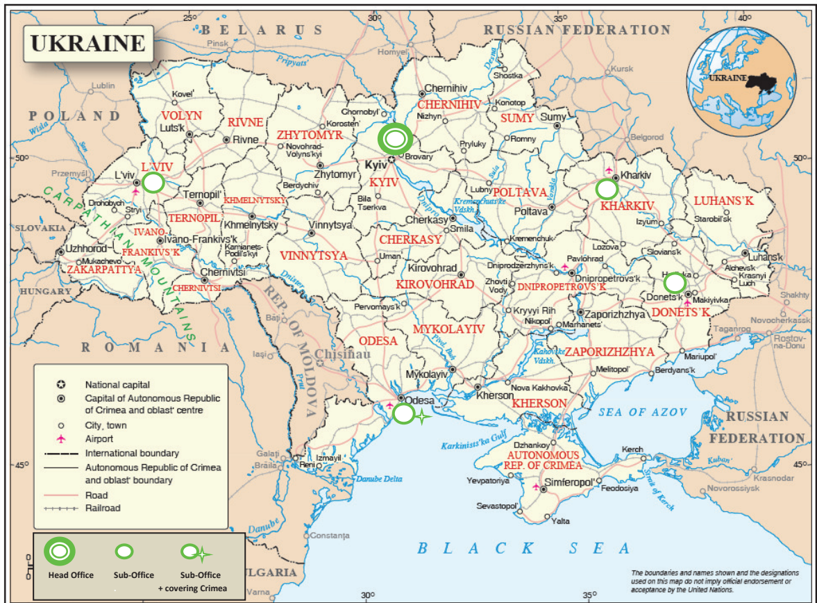
Map No. 3773 Rev. 6 UNITED NATIONS March 2014

Department of Field Support Cartographic Section