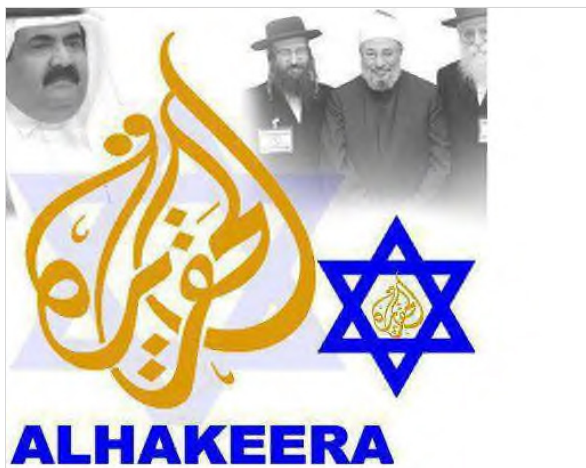
"Al-Hakeera [the pitiful]" (facebook.com/intifadamasria, July 10, 2013.)