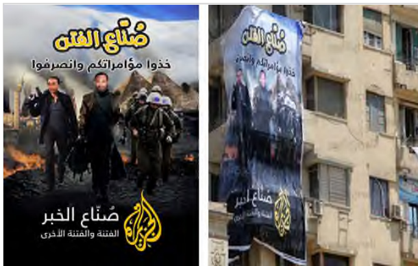
"Al-Jazeera – the fitna [civil war] and the other fitna[a parody on the channel's slogan 'The opinion and the other opinion']"; "Fitna producers, take your schemes and beat it!" (facebook.com/jazeera.Fetna/photos_stream#!/jazeera.Fetna, July 6, 2013)

Another combined street and Facebook campaign features well-known Al-Jazeera presenter Ahmad Mansour in a composite picture with the pyramids in flames, and standing next to Israel Defense Forces soldiers.