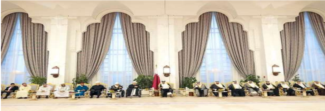
Amir hosts Iftar banquet for scholars, judges and imams