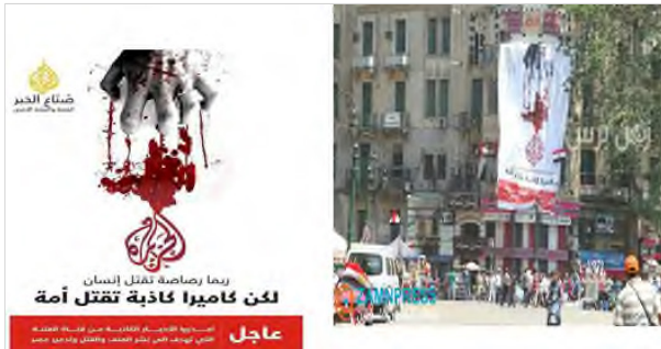
Street and Facebook campaign against Al-Jazeera: "A bullet may kill a person, but a lying camera kills [an entire] nation: beware of false news on the fitna channel that strives to disseminate violence and killing and cause Egypt's collapse" (.facebook.com/Scandals.of.AlJazeera.Channel, July 9, 2013.)

Another combined street and Facebook campaign features well-known Al-Jazeera presenter Ahmad Mansour in a composite picture with the pyramids in flames, and standing next to Israel Defense Forces soldiers.