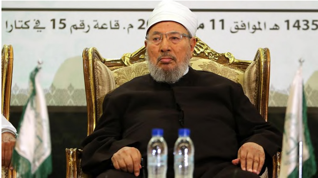
Yousef Al Qaradawi, the radical Egyptian head of the Muslim Brotherhood frequently uses AJ Jazeera to justify suicide bombings.

Prominent US consultants engaged by Qatar as part of its influence operations in the US have quit in recent days, including one in outright protest provoked by pictures of the emir and Yusuf al-Qaradawi, who has a long track record of incitement to violence.