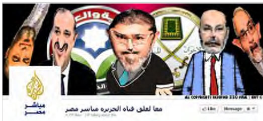
Facebook page "Together For Closing The Al-Jazeera Direct Egypt[channel]" (facebook.com/eljezira.misr, July 9, 2013.)